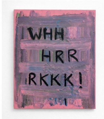
Xavier Noiret-Thomé, Whh hrr rkkk!! , 2026

Bloem in Oostende | voorstelling wandelgids in Oostende - UiTinVlaanderen