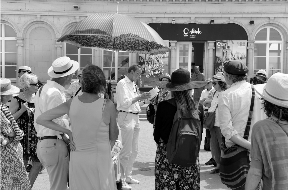
The first Bloomsday in Ostend in the Belgian press, VRT news [in Dutch]. Click here .